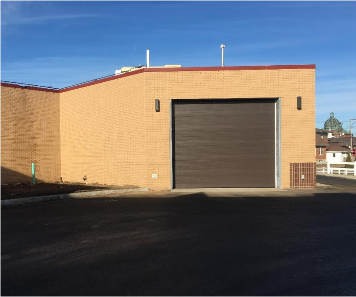
A view of the exit door of the ambulance garage that was recently open.