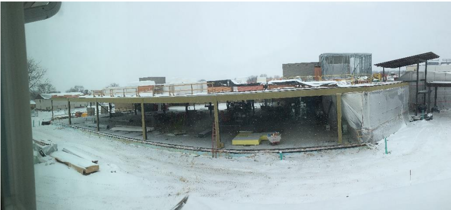
The concrete floor for the upper level of the new addition has been poured and will soon be enclosed with plastic as the areas shown to the right are.