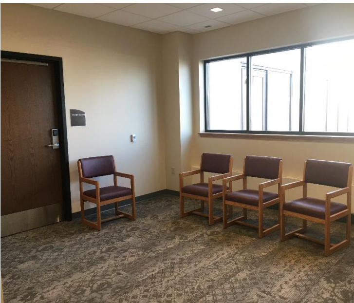
A view of the existing ER Waiting Area that was changed around a bit, with new ceiling tiles and carpeting! The door shown goes to the family room, which used to be a window to the exterior.