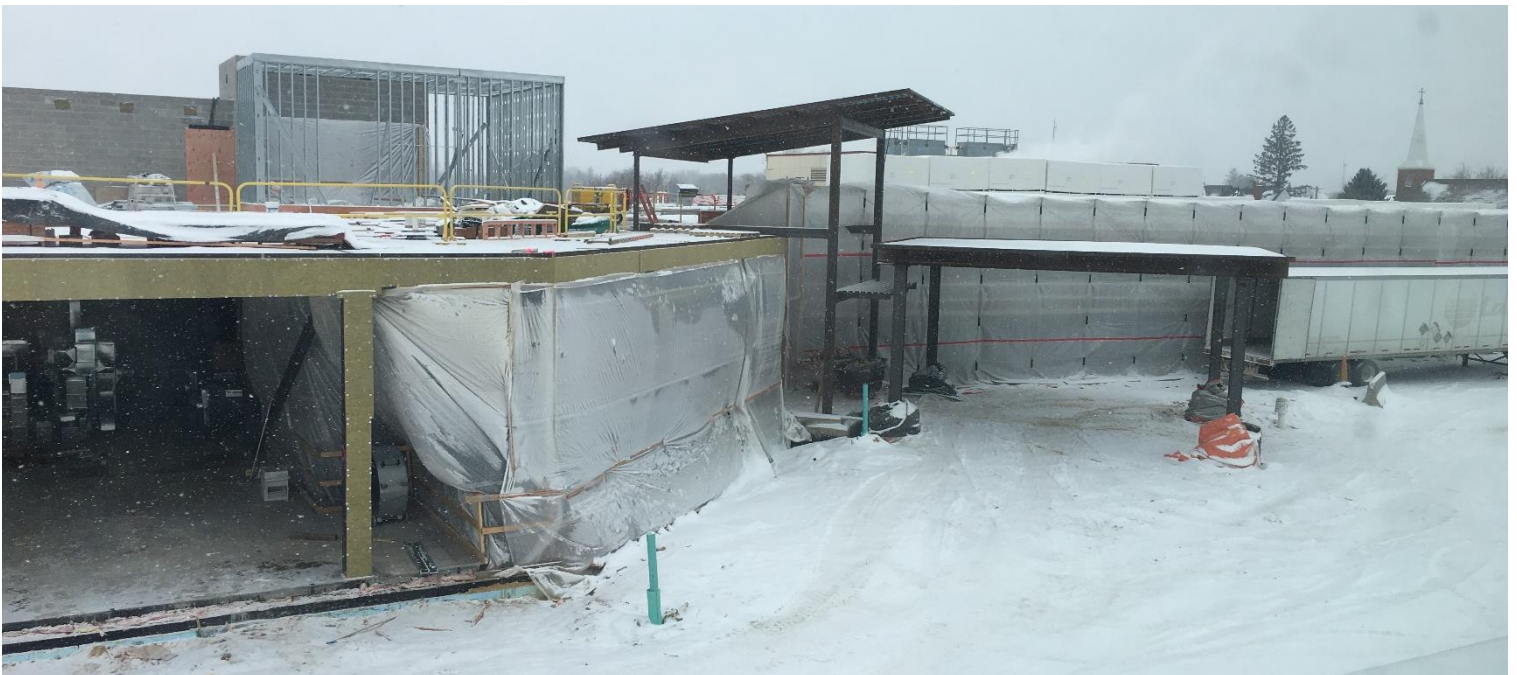
A view of the steel that is in place, along with the new main entrance structure. You can see the snow on the ground as well which does not stop the field from getting their work done!