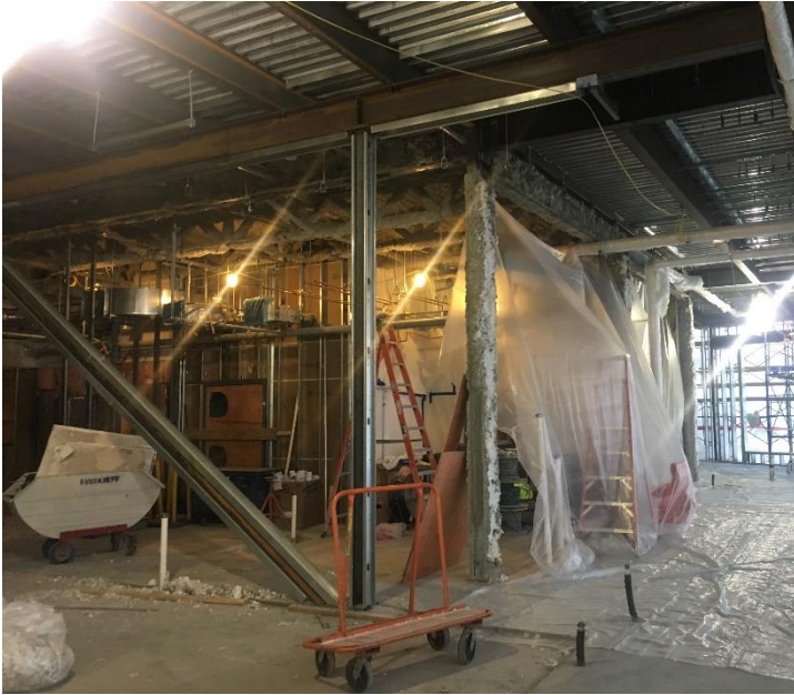
The old Business Office exterior walls are being demolished in order to tie in the new Imaging Area rooms.