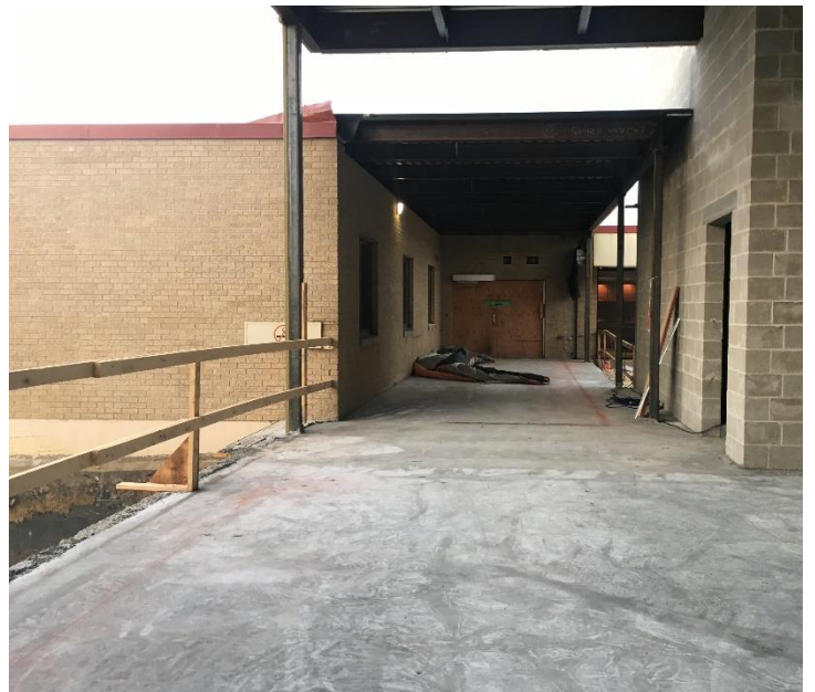
A view of the existing admin wing (to the left) and what will be the new corridor to the upper level of the addition.