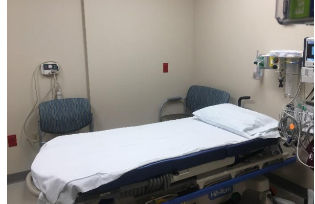
A view of one of the Exam Rooms in the Emergency Department!