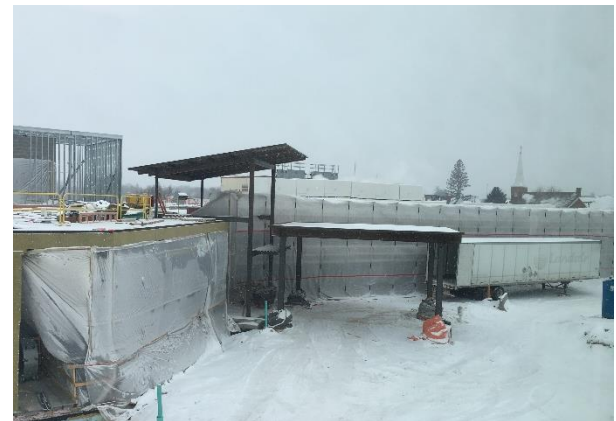
All of the plastic shown on the exterior of the structure is used to provide heat to the workers in order to put walls up and enclose the building.