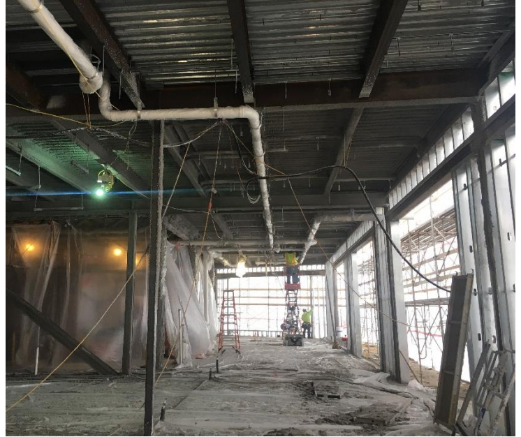
A field crew works to fireproof the steel beams added in the new addition.