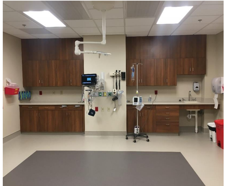
New casework and equipment installed in the brand new Trauma Room in the Emergency Department.